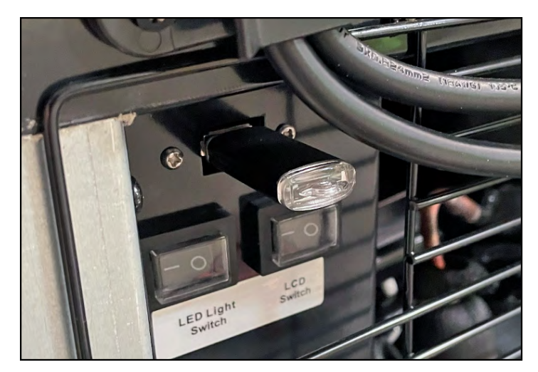
USB drive without cover installed.

These instructions are for the installation of a metal cover to help protect USB flash drives that are inserted in the rear of GVG models from being tampered with. Before and after images are shown below.