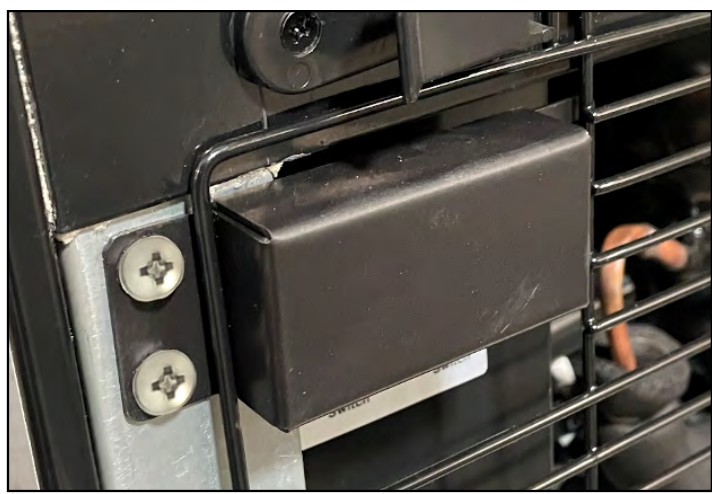
Finished USB Cover Installation.